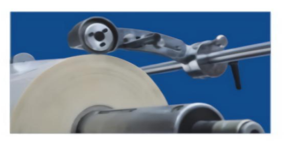
打孔和分切刀片 Perforating and cutting knife