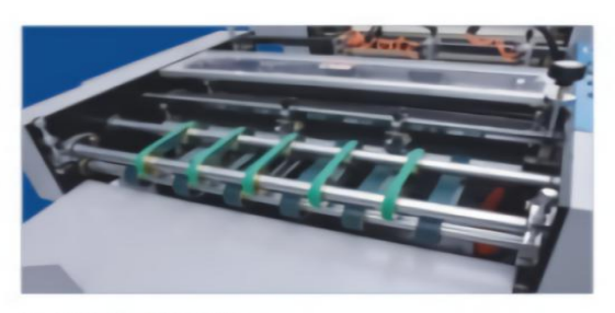
瓦楞曲纸系统 Corrugrated Delivery A corrugatted delivery system collects papaer easily